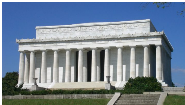
The Lincoln Memorial