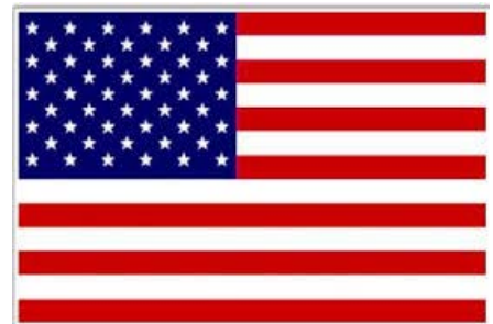
The United States Flag