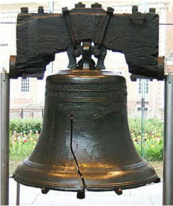
The Liberty Bell