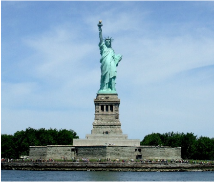
The Statue of Liberty

Identify the following United States and Maryland State symbols.